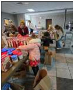
Preschool: volunteering, food collection and organization

Living. Learning. Serving. Christ. These are more than words; they are the legacy we seek to instill in every child. As our students grow from curious preschoolers or kindergarteners to confident 8th graders, these four values shape their character and guide their journey. Our hope is that every student who attends St. Timothy Catholic School leaves with a strong academic foundation, a generous spirit, and a deep and lasting faith. We pray they go forward prepared for high school, ready to bring God's mission into the world.