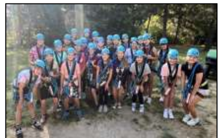
Middle School: rebuilding, making a safer community