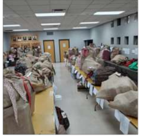
We are packed and ready for delivery to the families in Gallatin County and pick-up for our neighbors in Florence and Union.