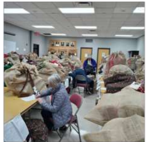
One final check