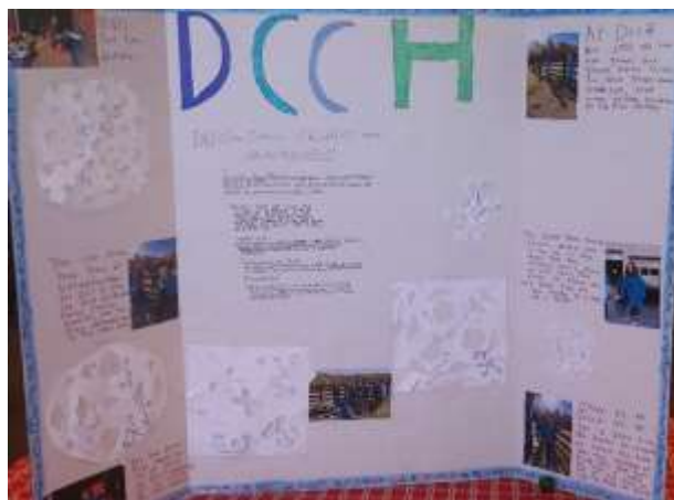
The St. Timothy Catholic School Students