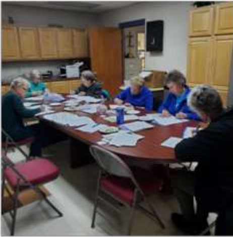
Writing the gift tags