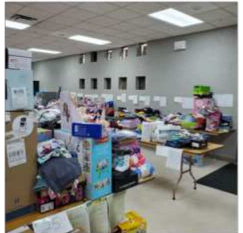
Checking the list once