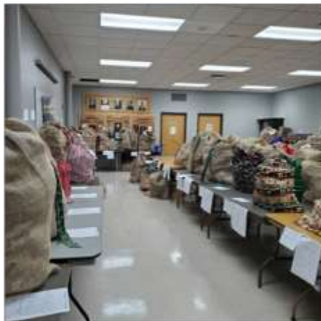
Santa sacks are packed