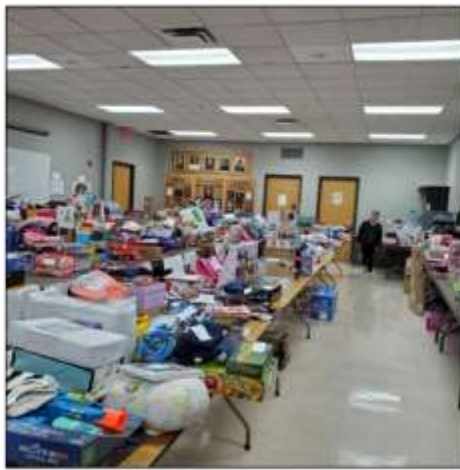
The gifts begin to arrive