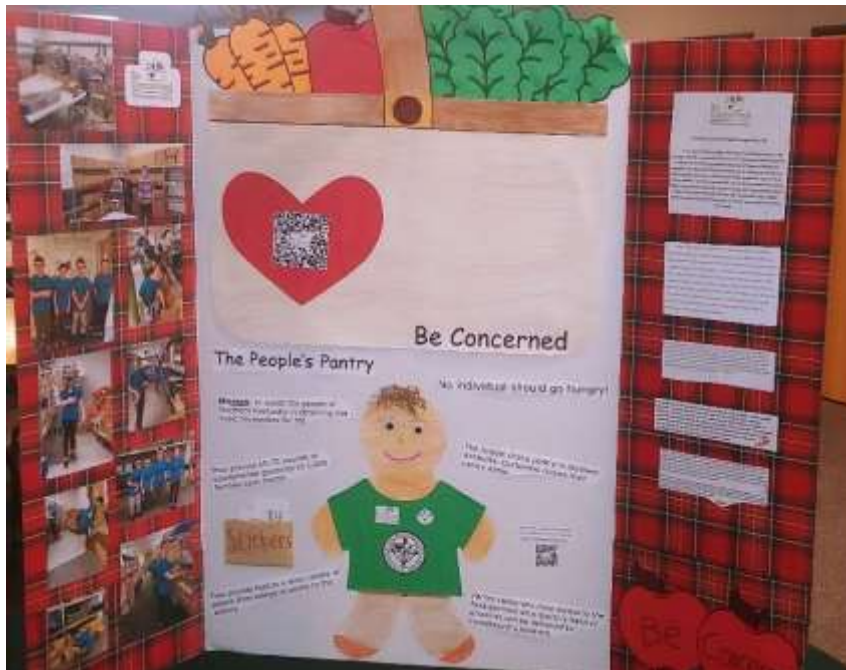
The Covington Latin Students