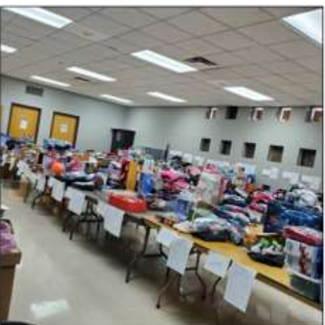
Checking it twice